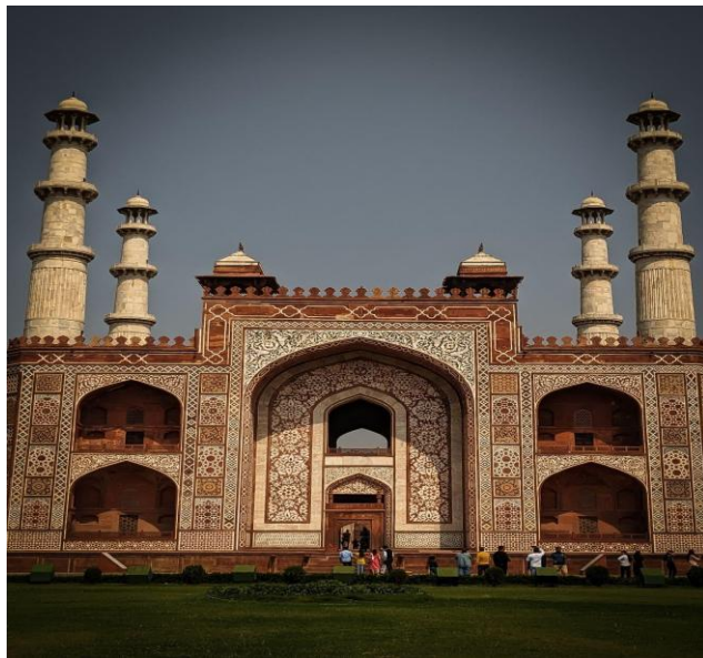
(Tomb of Akbar's entrance)

Since they were accompanied by teachers who were specialised in medieval Indian history they had explained the monument structure and their creation as a political and architectural structure.