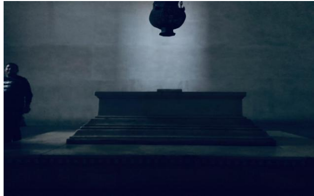
(Tomb of Akbar)

The mausoleum is situated on the outskirts of Agra city. The uppermost storey stands in contrast with the rest of the structure as it is composed of white marble with insertion of red sandstone. The Tomb of Akbar is a typical representation of the symmetry of Mughal architecture, along with the display of a fusion of Rajputana and Gothic styles as well. It is placed in a Charbagh setting of garden with a water canal dividing it by four sections.